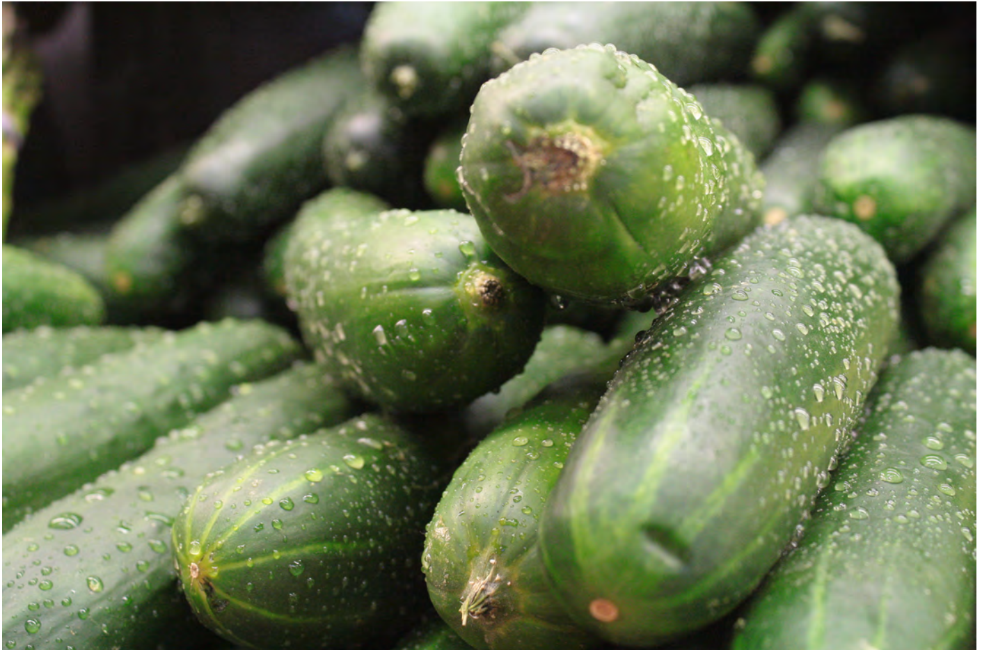
"Cucumbers" (Arcata, CA)

indicating that there was a need for this kind of support and that we will soon be seeing greater numbers of exciting food studies events throughout the year. Find more information about the ASFS Grants and how to apply on the ASFS website at food-culture.org/ASFS%20Grants .